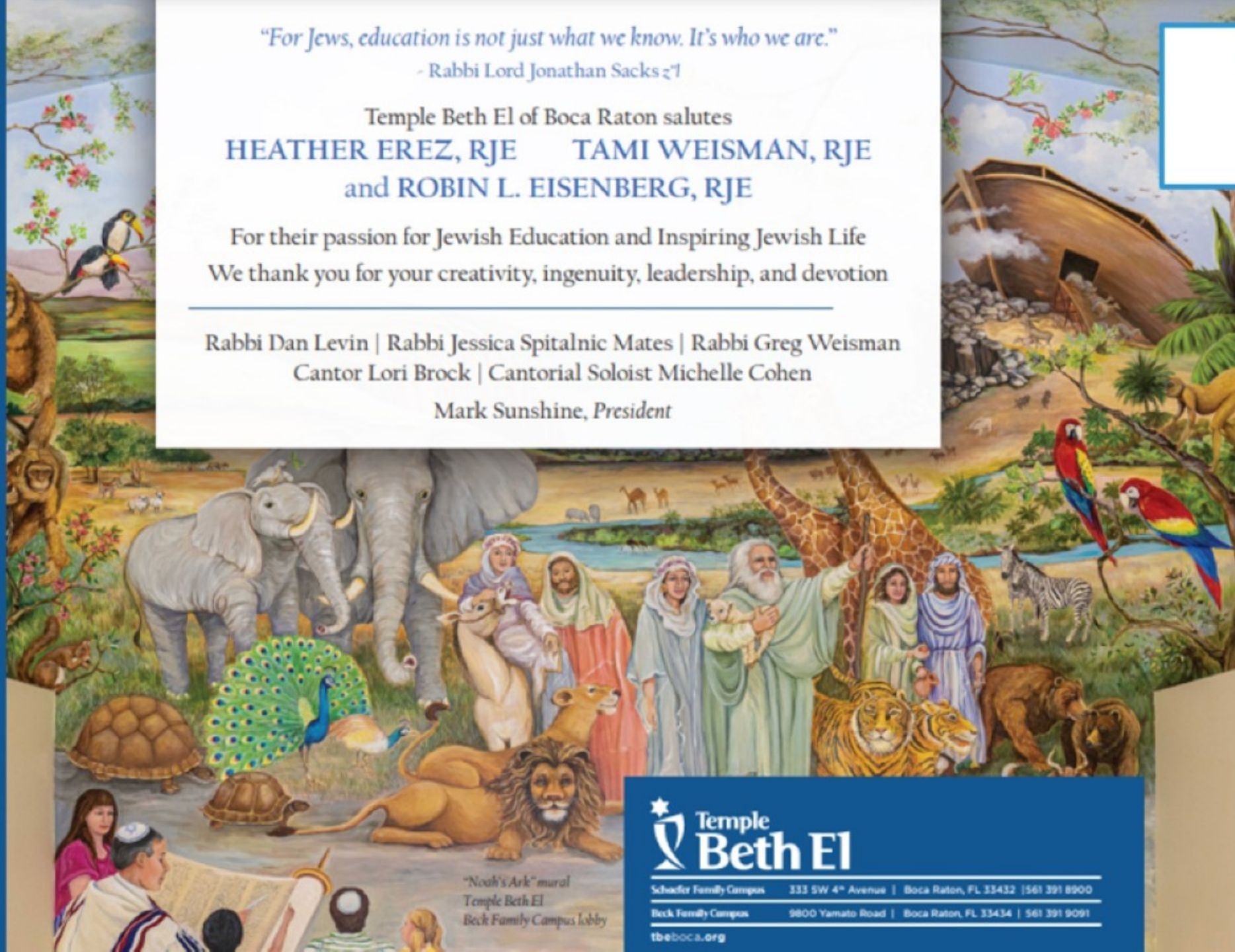
"Noah's Ark" mural Temple Beth El Beck Family Campus lobby